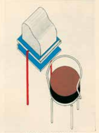
Table Machine à écrire et siège